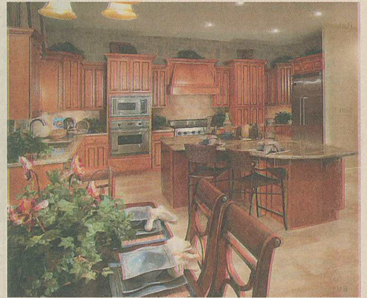
Piano-shaped kitchen islands, like the one featured here, are among McGlone's favorite home features.

trends in concert with what our buyers feel is important."